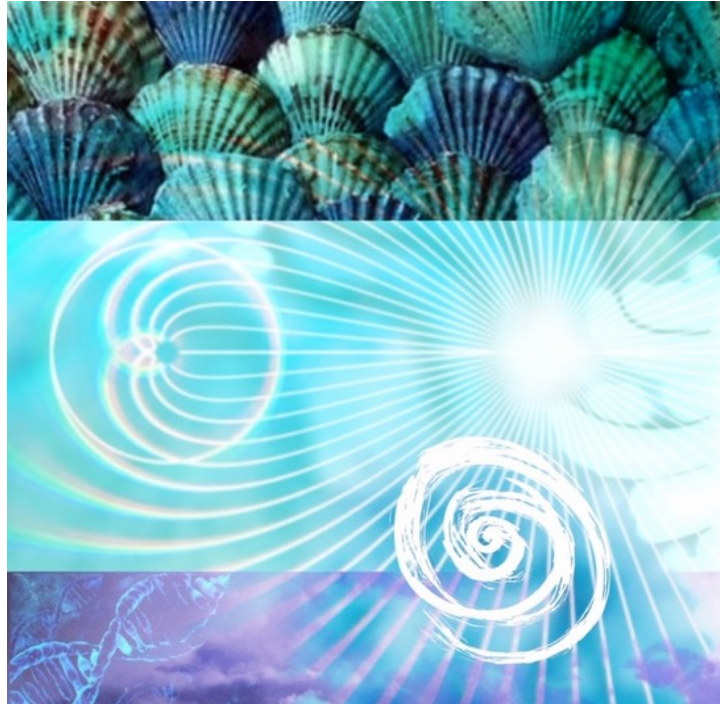
Illustration 1: Seashells & DNA by Nataki Bhatti